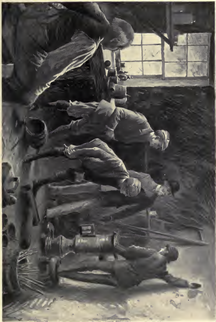
OSK ASSISTS IN THE SEARCH.